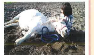
Communicating with horses