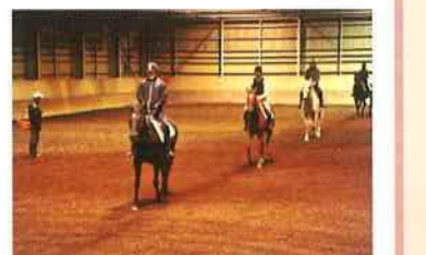
Horse riding lesson