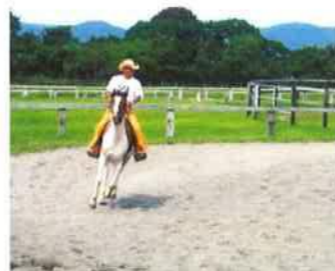
Horse riding lesson